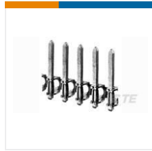
MACH APL BAND W/POST 15 DPLX, ROHS 6-103577-5