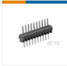
25 SYS 50 HDR SRST UNSHRD SN 6-104178-3