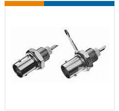
BNC - SOLDER RECEPT 5227169-8