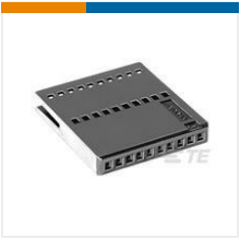
022 HOUSING FFC RCPT 050CL SR 1-487544-9